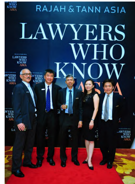
Lawyers from Christopher & Lee Ong