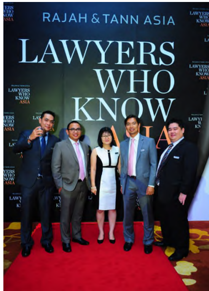
Lawyers from Rajah & Tann (Thailand)